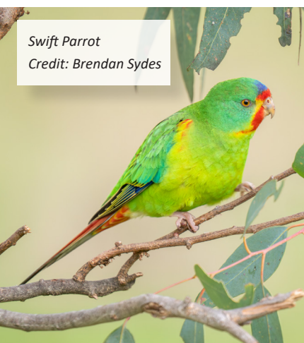
Swift Parrot Credit: Brendan Sydes

Tasmanians are rightly proud of our beautiful and unique environment. No wonder there is such community concern when we see governments failing in their duty to protect, conserve and restore it.