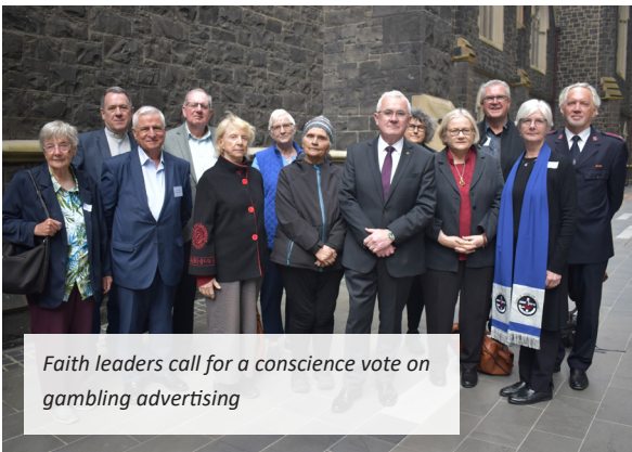
Faith leaders call for a conscience vote on gambling advertising