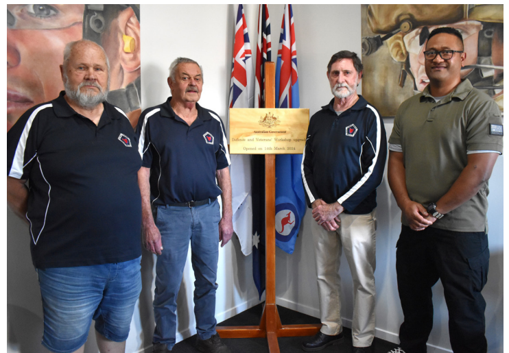
Members of the Defence and Veterans Workshop