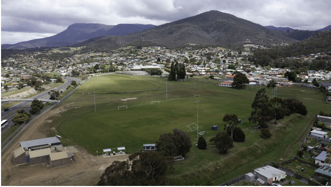
Site of the future Chigwell Soccer Hub