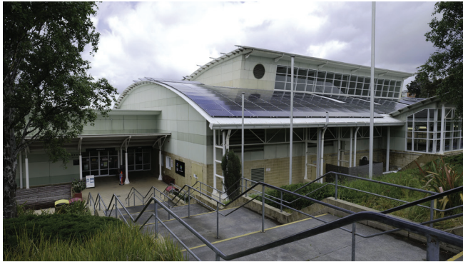
The Doone Kennedy Aquatic Centre in Hobart