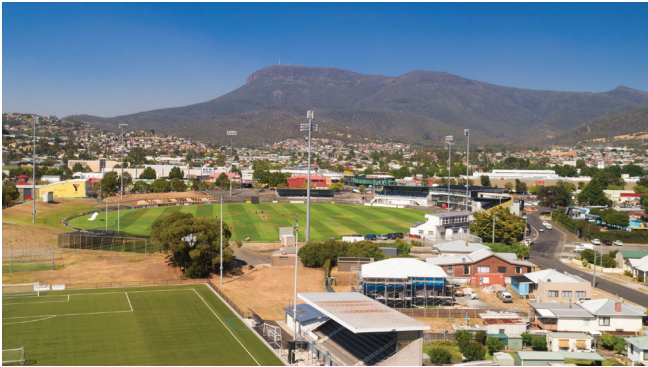
KGV sports precinct